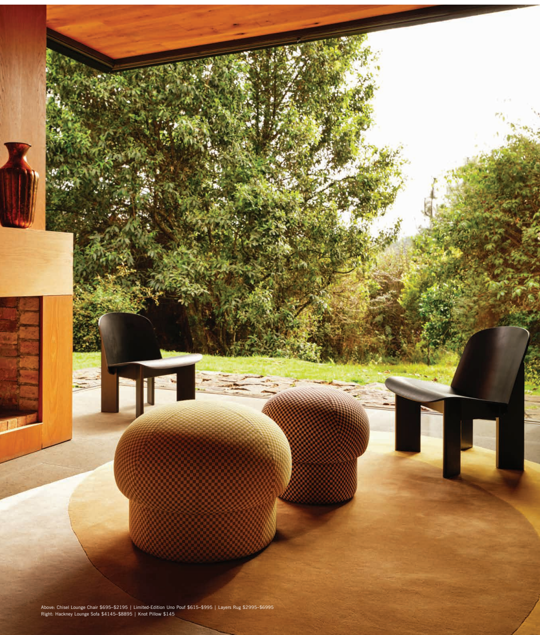
Above: Chisel Lounge Chair $695-$2195 | Limited Edition Uno Pouf $615-$995 | Layers Rug $2995-$6995 Right: Hackney Lounge Sofa $4145-$8895 | Knot Pillow $145