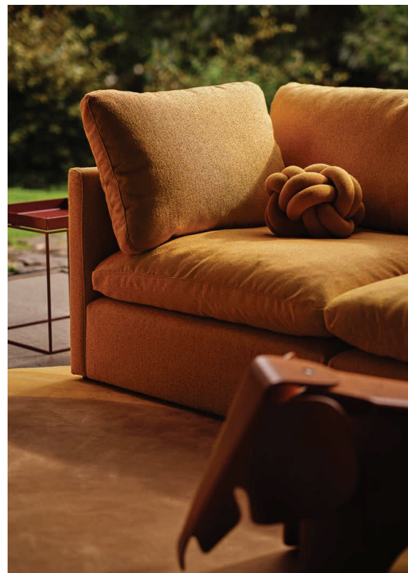
Hackney Lounge Sofa by HAY