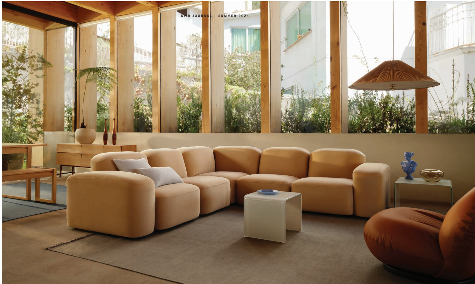
NEW: MUSE VELVETS