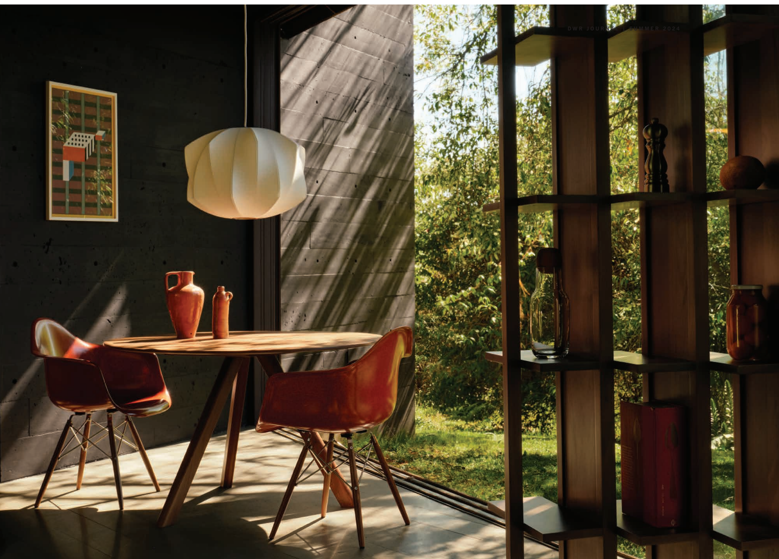
Copenhague 20 Dining Table $645-$1075 | Eames® Molded Fiberglass Armchair from Herman Miller® $745-$1175 $996-$940 | Nelson® Bubble Lamp® from Herman Miller® $395-$1295 $316-$1036 | Transversal Bookshelf $6795