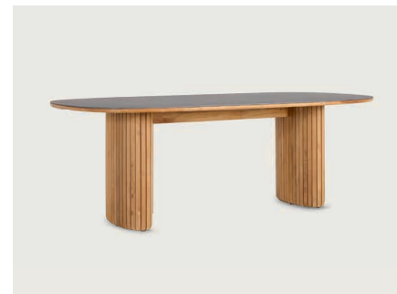
Softlands Square Dining Table $4995, Dining Chair $1795, Lounge Chair $2995, and Oval Dining Table $7595