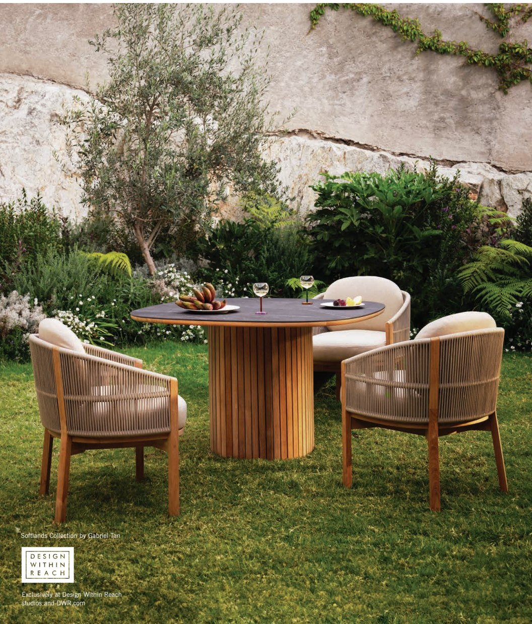
Softlands Collection by Gabriel Tan