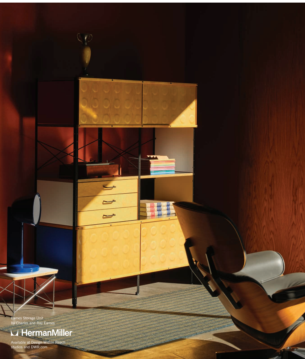
Eames Storage Unit by Charles and Ray Eames