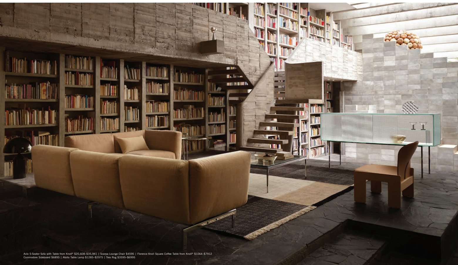
Avio 5-Seater Sofa with Table from Knoll® $20,608-$35,941 | Scarpa Lounge Chair $4595 | Florence Knoll Square Coffee Table from Knoll® $1064-$7912 Commodore Sideboard $6895 | Abello Table Lamp $1285-$2975 | Tres Rug $3595-$6995