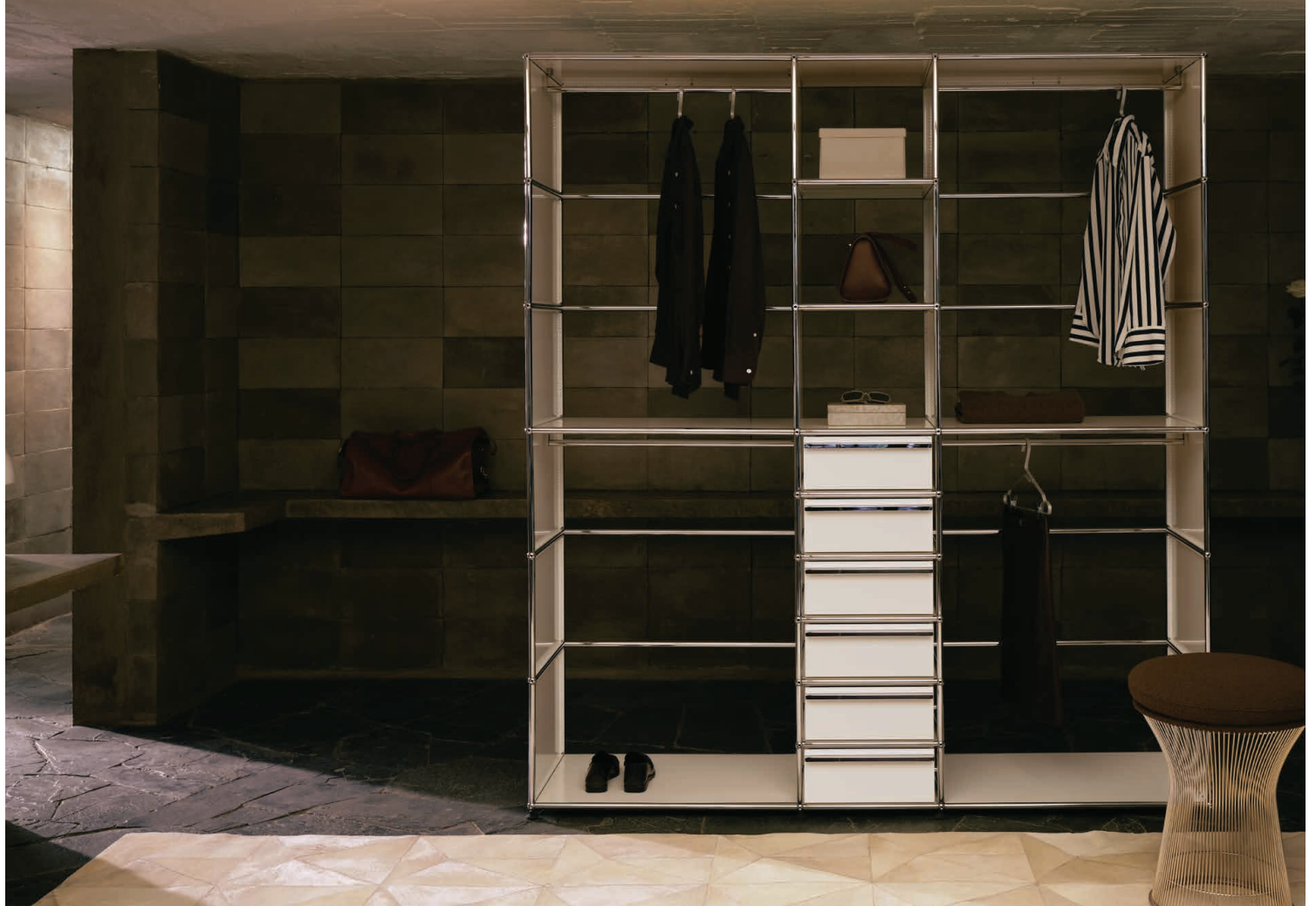
USM Haller Small Wardrobe $3683 and Large Wardrobe $9963 | Diamond Cowhide Rug $1495-$3995

Here's the secret to creating your perfect closet: a storage system that beautifully displays (or hides away) your wardrobe. Made in Switzerland, the new USM Haller Wardrobe features sleek, all-steel construction that's built to last for generations and a flexible, modular design that can be easily expanded upon. A variety of colors and options, including drawers, drop-front cabinets, and hanging rods, lets you design a custom closet that truly fits your needs.