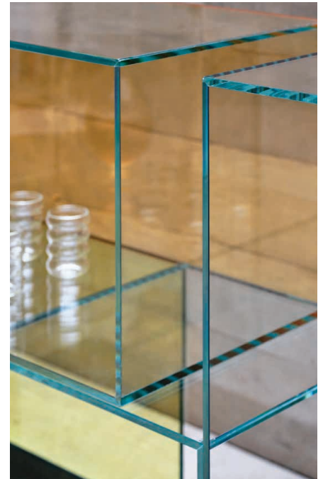
Left: Quantum Bookshelf $7395 | Spin Candelabra $750-$1100 | Above: Commodore Sideboard $6895 | Opal Bowl $170-$325 | Puck Coupes, 2-Piece Set $120