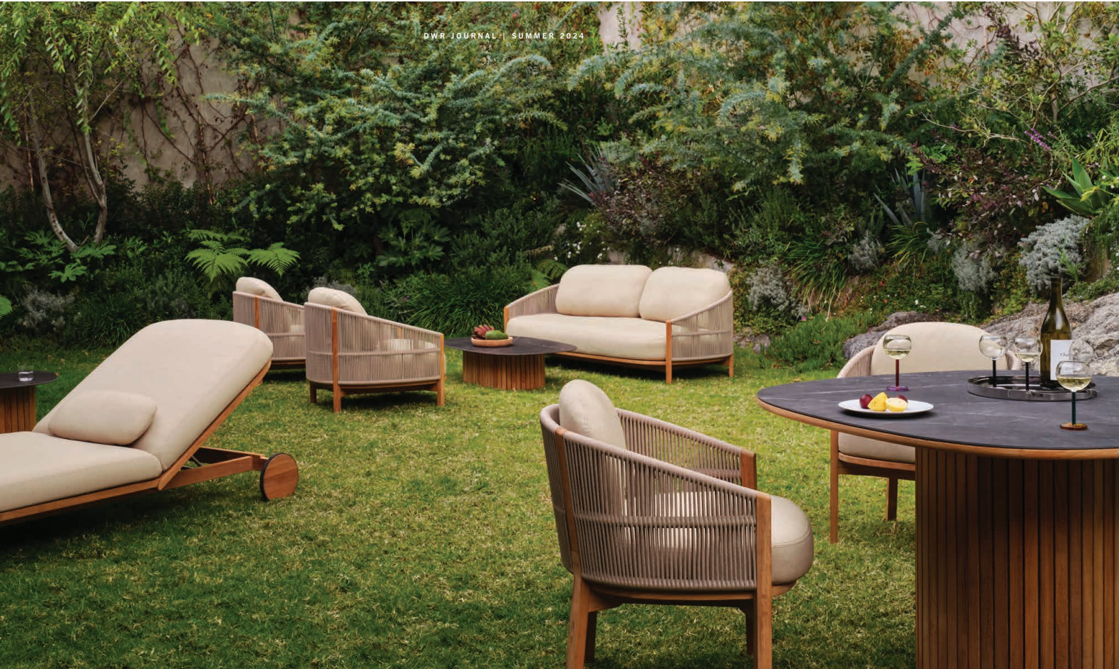
Softlands Dining Table $4995-$7595, Dining Chair $1795, Adjustable Chaise $3995, 2-Seater Sofa $5995, Lounge Chair $2995, and Coffee Table $2495 | Bilboquet Wine Glasses, 2-Piece Set $100

Marrying all-weather durability with thoughtful craftsmanship, Softlands offers an inviting approach to outdoor dining with plush cushions and softly rounded ceramic and teak tables.