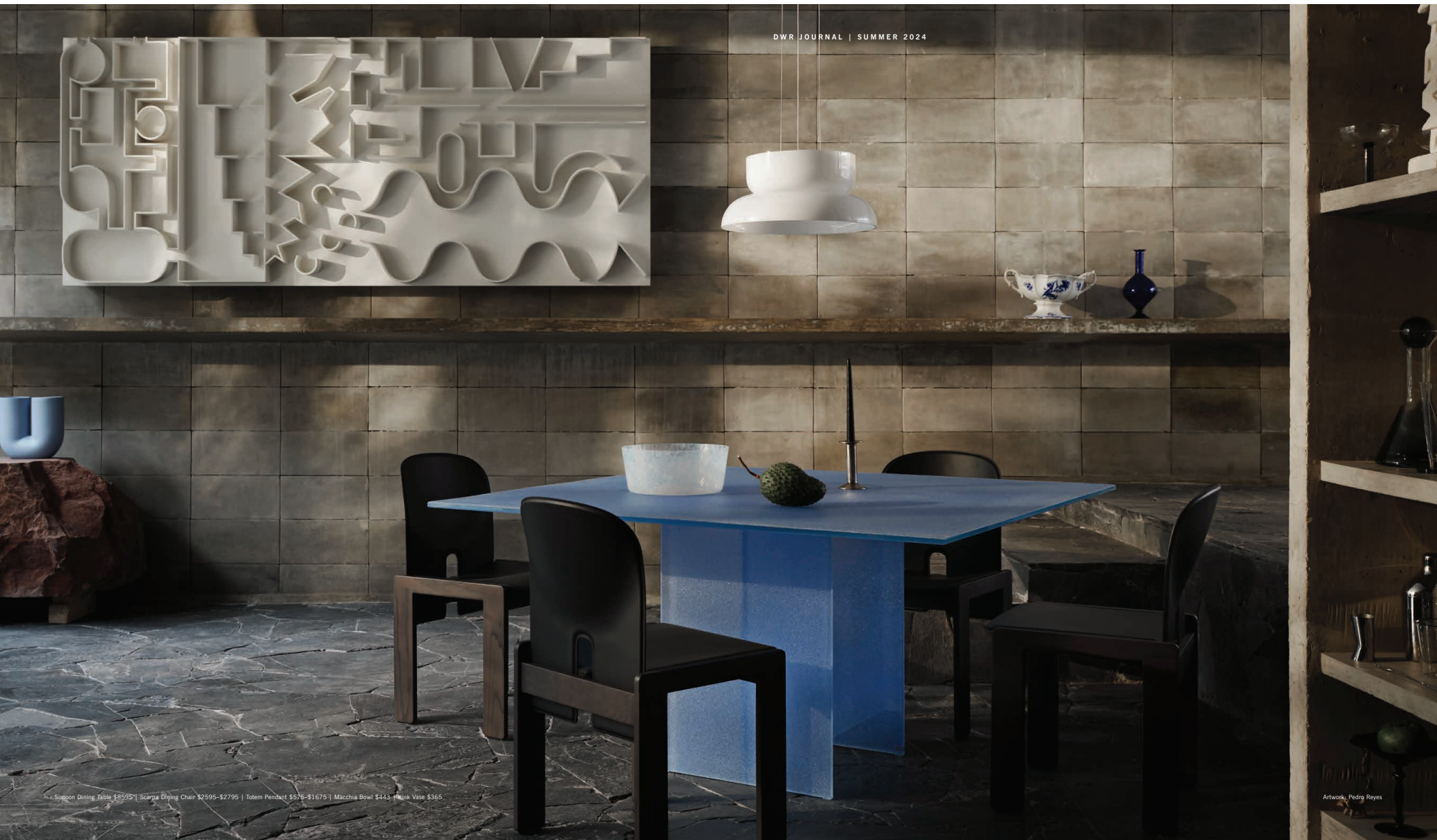
Sirapoon Dining Table $8595 | Scarpa Dining Chair $2595-$2795 | Totem Pendant $575-$1675 | Macchia Bowl $443 | Monk Vase $365