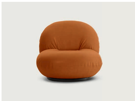
NEW: PACHA CHAIR IN LEATHER